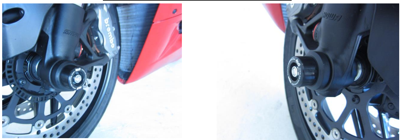
Le kit contient les articles exposés ci-dessous, vérifier que toutes les pièces soient présentes avant de procéder au montage.